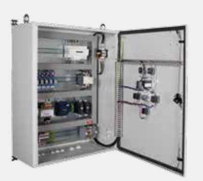
Standard power control panels CETAL offers a large range of cost-effective power control panels.